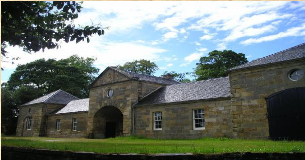
The National Trust for Scotland